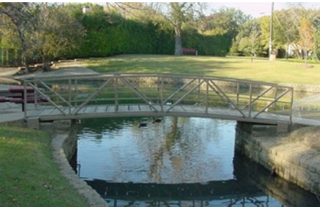
Farmers Branch Rawhide Creek Study