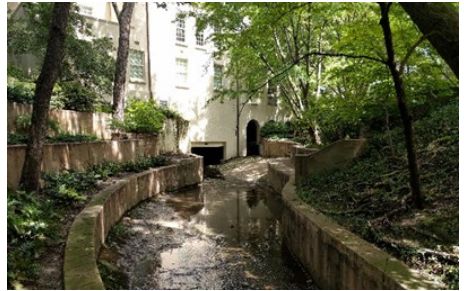
Highland Park Town Hall Floodproofing