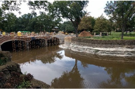
University Park Dam/Hydrologic Assessment