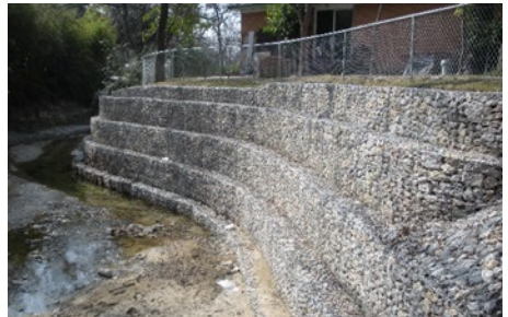
Dallas Streambank Stabilization and Erosion Control

Certified State of Texas Historically Underutilized Business (HUB)