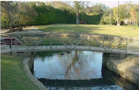
Farmers Branch Rawhide Creek Study