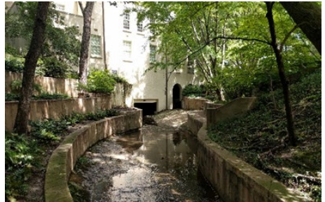
Highland Park Town Hall Floodproofing