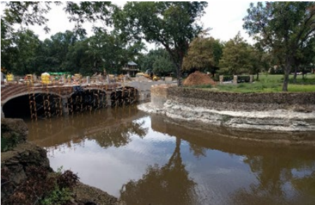
University Park Dam/Hydrologic Assessment